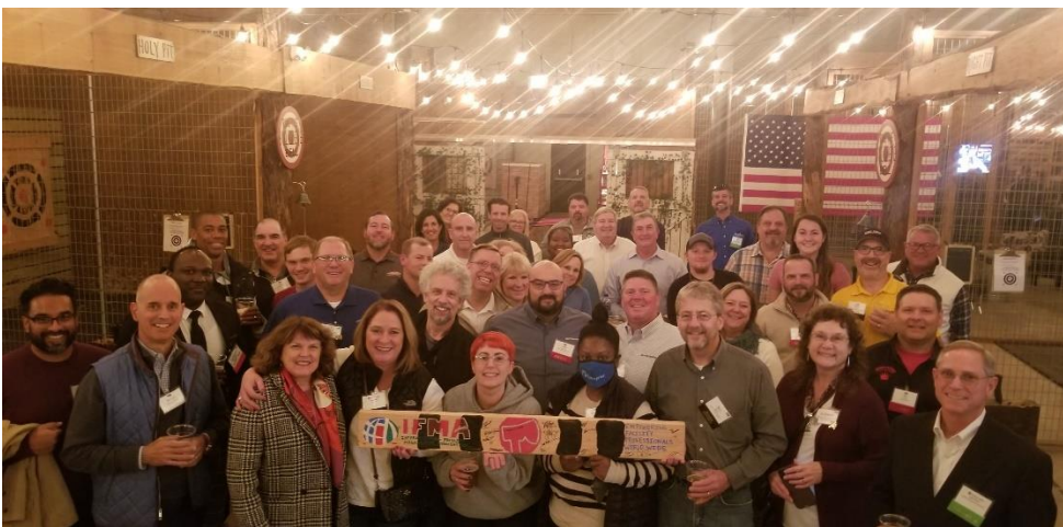
Happy Axe Throwers!