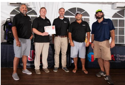
Akehurst Landscape Services – First Place Winners