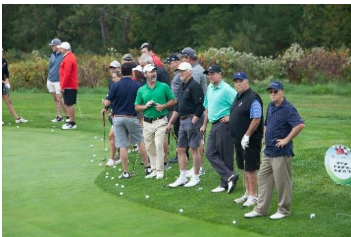
Ready for the Scramble Putt!