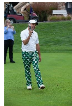
Lucky Irish Pants