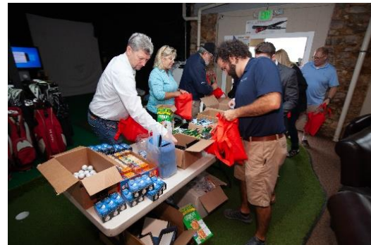
Volunteers Filling Goodie Bags