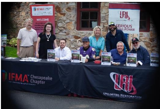
Volunteers at the Registration Table