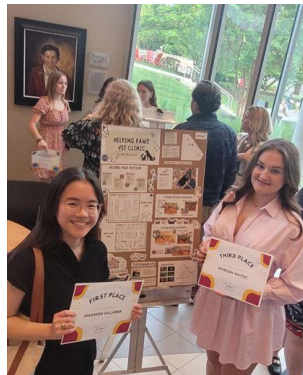
NDP 1 st & 3 rd Place Winners