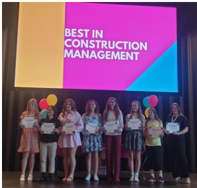
NDP Project Winners

I highly encourage that if anyone is looking for a meaningful and rewarding way to showcase FM as a career path for the generations to come, look into the opportunity of working with our Chapter and the ACE Mentor for next year's program!