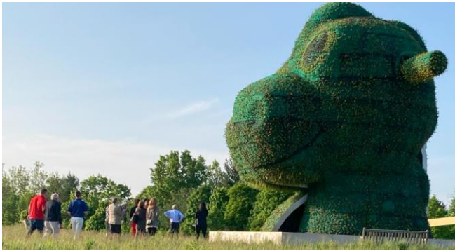
Group Tour – Jeff Koons - Split Rocker , 2000

We are so appreciative to our hosts at the Glenstone Museum, in Potomac, Maryland, for a very special evening. Both the IFMA Chesapeake, and IFMA Capitol Chapters were able to come together and enjoy an evening of networking, house made food, and art appreciation, at a very special venue. We hope to see our friends from the capital chapter in the near future at another event and are always hoping that others will join us for our future events. Please make note of our future events at www.ifmachesapeake.org