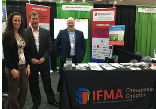
CHAPTER MEMBERS STAFF THE BOOTH IN 2019!

The gathering place to catch up with chapter friends, and prospective members, and to hear about all things FM! Giveaways, Connections, Conversation and Raffles! Stop by and say hello!